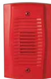
MHR UL S4011