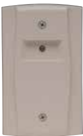
RA100Z UL S2522