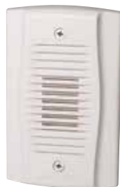
MHW UL S4011