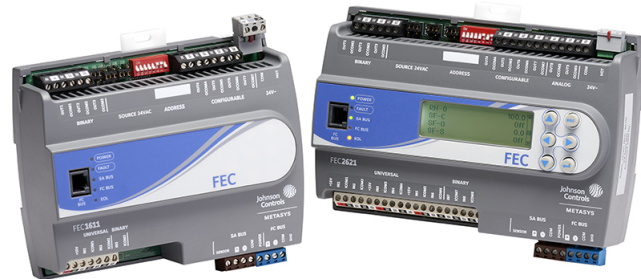
Figure 1: Field Equipment Controllers