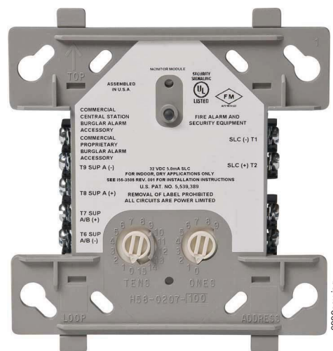
FMM-1(A) (Type H)

Use to monitor a zone of four-wire smoke detectors, manual fire alarm pull stations, waterflow devices, or other normally-